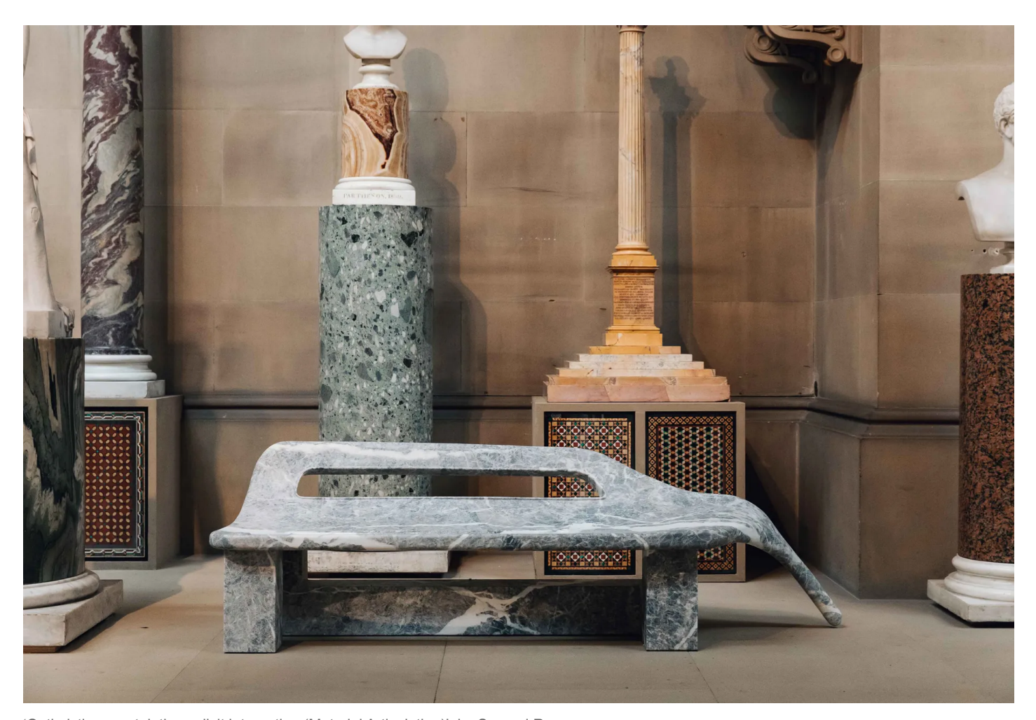
'Optimistic uncertainties solicit integration (Material Articulation)', by Samuel Ross