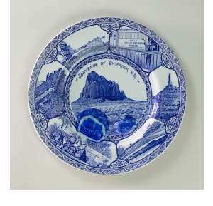
13.5 x 17 x 2"

transfer print collage, on shell-edged pearlware platter c.1840 with uranium glass