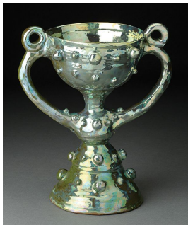
Beatrice Wood "Blue Chalice" 1985–88 earthenware, lustre glaze, 11 x 10 x 6 inches Courtesy of the Pennington Collection.