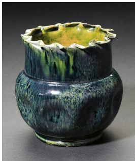
George Ohr "Green & Indigo Large Dimpled Vase with Ruffled Rim" ceramic, glaze 5 x 5 x 5 inches