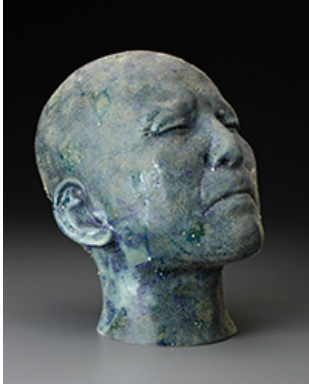
Takahiro Kondo, "Untitled," 2010, porcelain, glaze, 9.5 x 5.5 x 8".