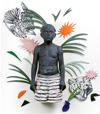
Cristina Córdova, "De mi isla salvaje (from my wild island)" 2015, ceramic, resin, pigments, tiles: 93 x 70", figure: 53 x 25 x 17".