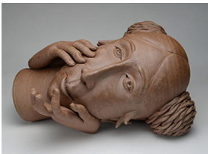
Gerit Grimm, "Female Head," 2015, wheel-thrown stoneware, 11 x 18 x 13".