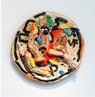
Viola Frey, "Untitled" (Horse, Bird, Monkey and Arms), 2001–2002, ceramic, glaze, 26 x 26 x 6".