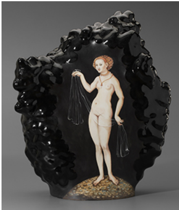
Kadri Pärnamets, "Past in Present" 2015, porcelain, slip, glaze, 16.5 x 14.5 x 7".